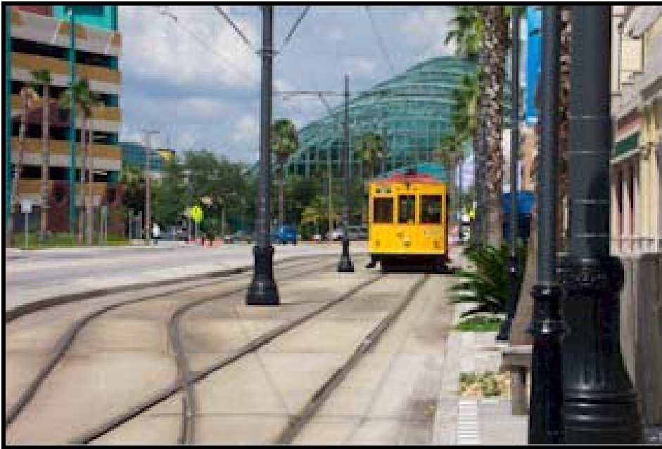
PHOTO IS OF TAMPA YBOR CITY STREETCAR PASSING SIDING